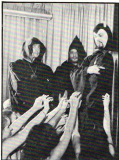
Radical socialist Anton Szandor LaVey, "Black Pope" of the First Church of Satan, now claims over seven thousand members around the world.

Next was a young Beverly Hills policeman who admitted that it just wasn't safe to travel his beat alone any longer because of the heavy "influx of Satanist dope fiends." He was not alone in that opinion. As one deluded and irreverent Californian put it: "The Second Coming has already come. Only J.C. didn't show up; Satan did. It hit Los Angeles first . . . ." Terrifying as it sounds, that is exactly the way many of the pot-smoking hippies with whom your reporter has spoken feel about the matter. Thanks to their drug cult and an incredibly clever build-up by both the Establishment media and the