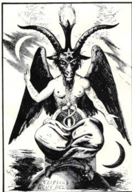
This Satanic horned deity was worshipped by many of the conspiratorial Knights Templar.